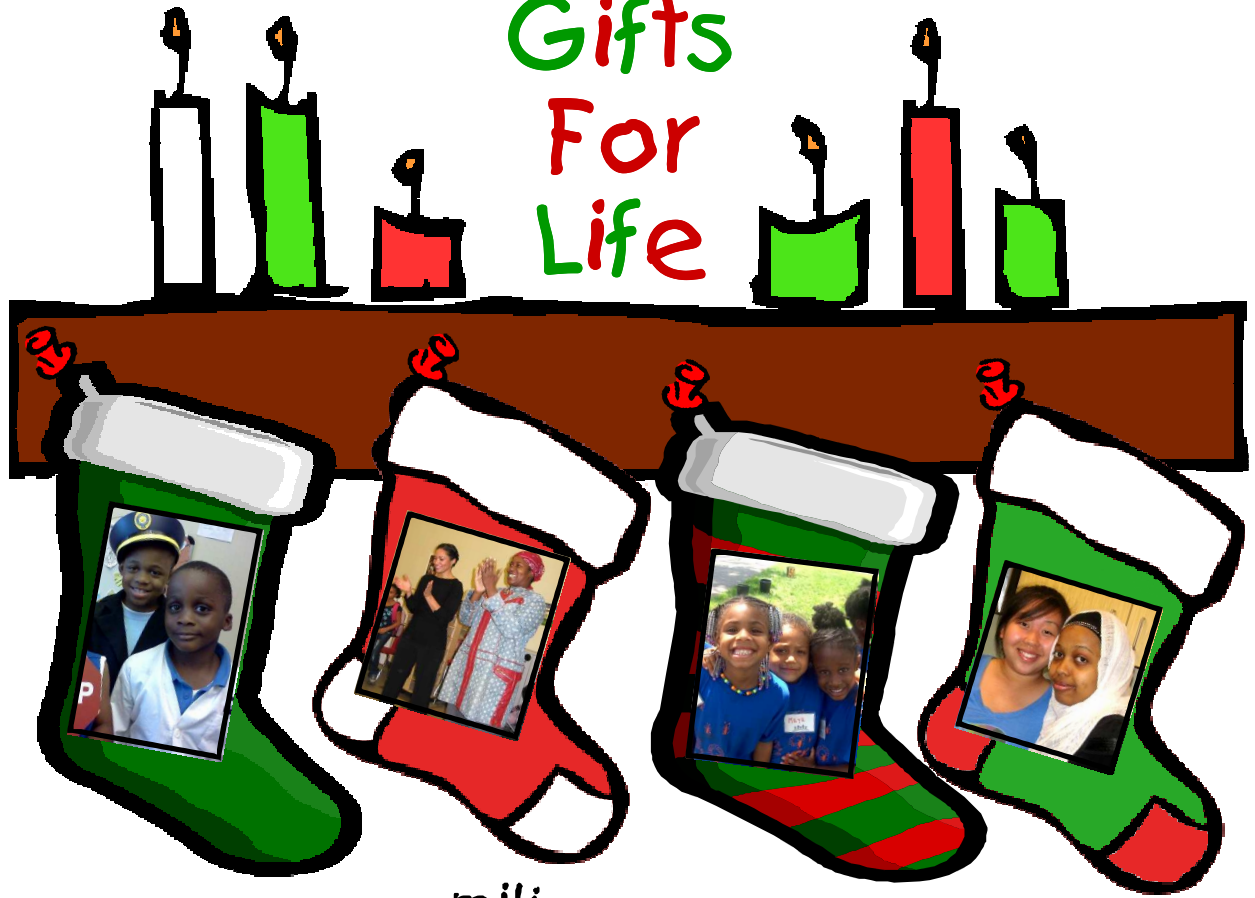
After School Kids